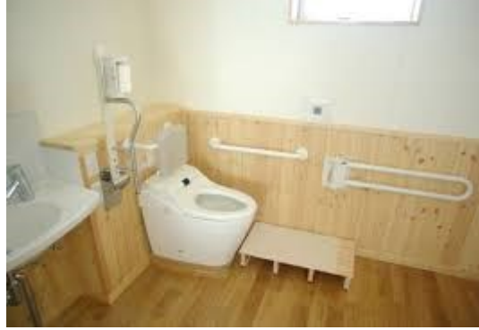
* image of wheelchair accessible restroom